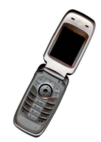
Fig. 3 Example of an image with acceptable resolution