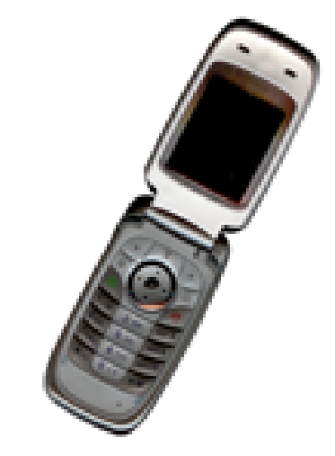
Fig. 2 Example of an unacceptable low-resolution image

must be placed after their associated figures, as shown in Fig. 1.